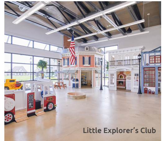
Little Explorer's Club