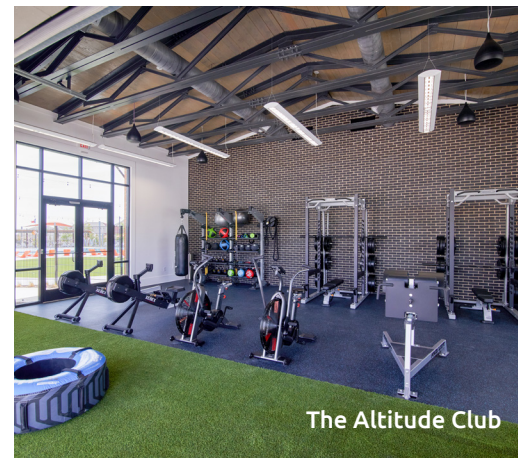
The Altitude Club